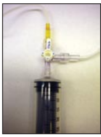
Figure 3: Stopcock positioning for transfer of blood from syringe to bag